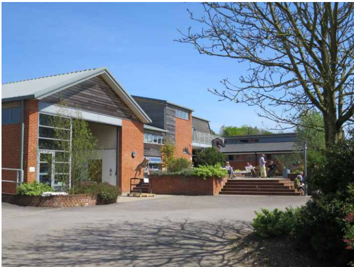
The Foundry Courtyard at Project Workshops

Project Workshops is a vibrant centre for the visual arts in Quarley near Andover, Hampshire. It is home to over a dozen artists who create a unique range of ceramics, furniture, glass vessels, pewter and silver metalwork, sculpture, stone carvings and paintings.